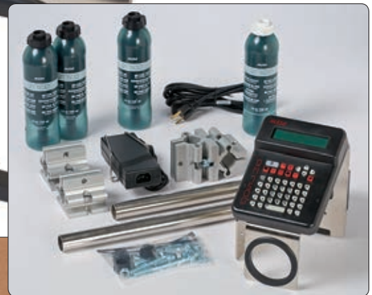
Pieces included in package